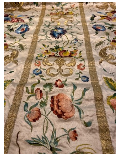
Late 17th century Italian chausable back silk embroidery on silk