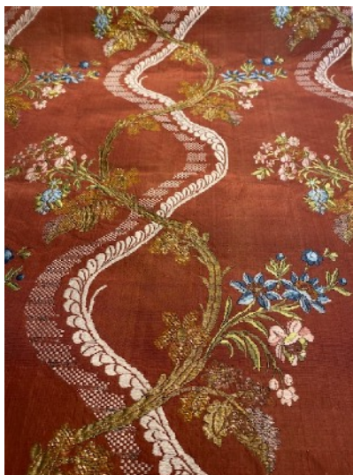
Early 18th century silk brocade dress fabric